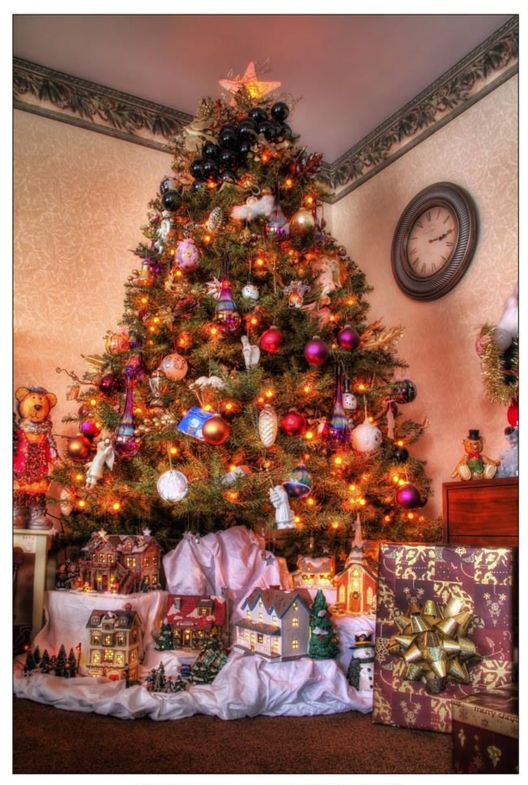
KEVIN G - PHOTOGRAPHY