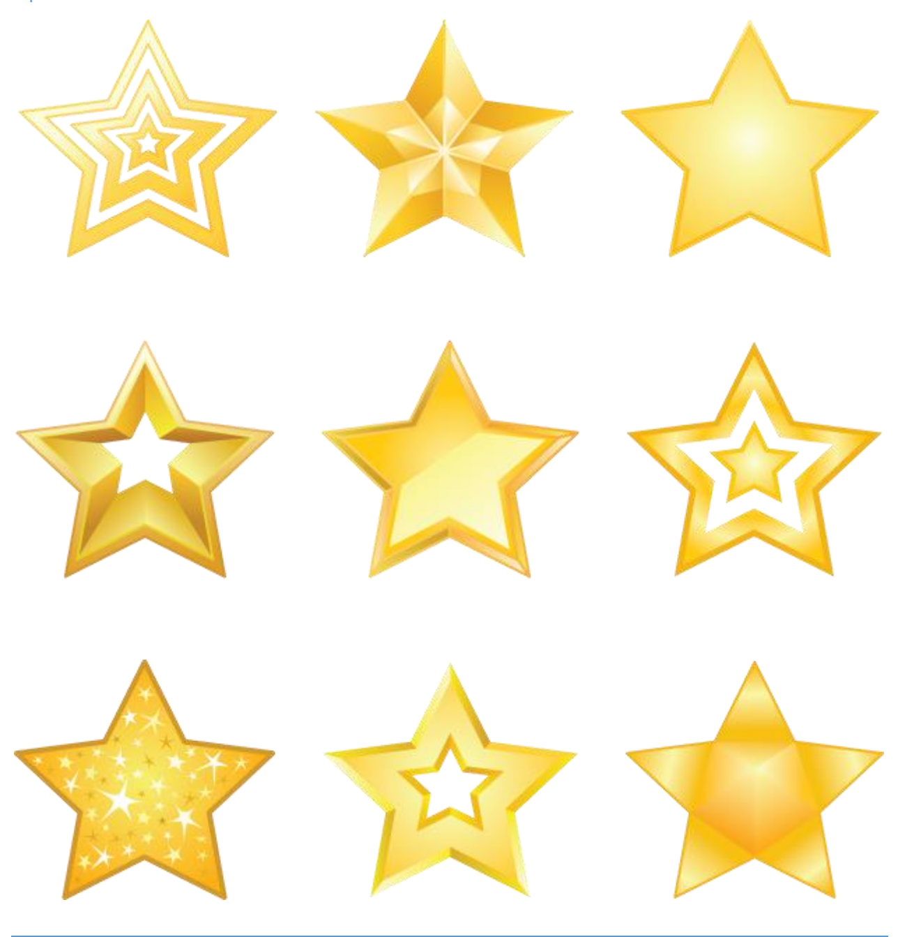
Every week the staff look out for those children who are just that little bit extra special in the current week to award them one of our Achievers Certificates.

It might be for lots of effort, fantastic presentation, super learning behaviour, lovely manners, being extra helpful or just that bit more determined than the others to finish their work accurately. They might just be an outstanding all-rounder.