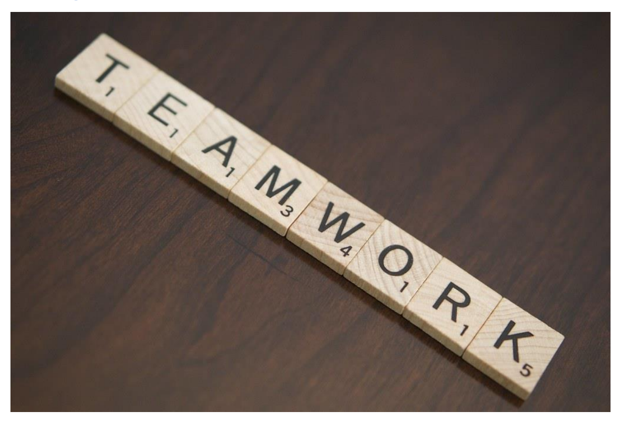
The winning team this week are the Dragon team!